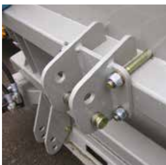
▲ OPTIONAL 3 POINT LINKAGE BRACKETS

A centrally mounted agitator shaft is operated hydraulically above the belt using a common hydraulic supply. Agitator tines can be mounted in pairs to prevent bridging and ensure even feeding down on to the belt. These can be removed depending on the type of material used.