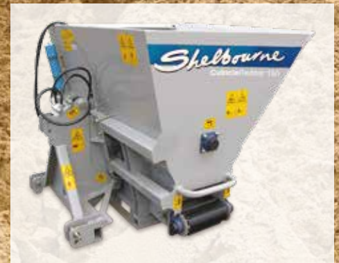
OPTIONAL 3 POINT LINKAGE HYDRAULIC TIPPING FRAME WITH "A" FRAME ATTACHMENT

THE SHELBOURNE CUBICLE BEDDER IS DESIGNED TO PROVIDE A UNIFORM BED QUICKLY AND EFFICIENTLY WITH A MINIMUM OF OPERATOR EFFORT.